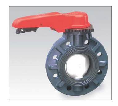
PVC BUTTERFLY VALVE