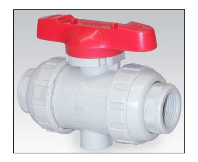
PVC 2 WAY BALL VALVE