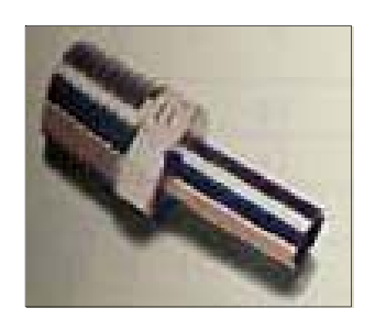
STUD STANDPIPE ADAPTATOR