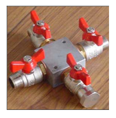
4 EXIT CROSS UNIT