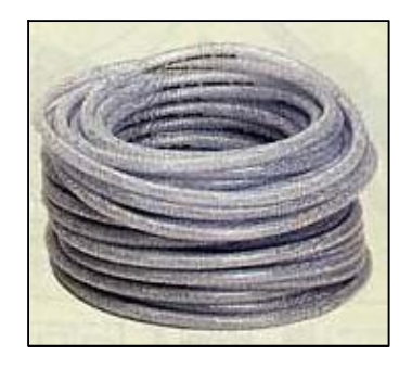
FLEXIBLE PLASTIC PIPES