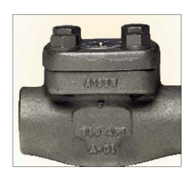
SINGLE DISK CHECK VALVE