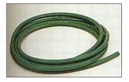
RUBBER PIPE RED ACETYLENE