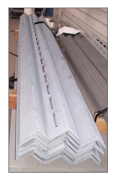
PERFORATED ROLLE EQUAL SIDED ANGLES